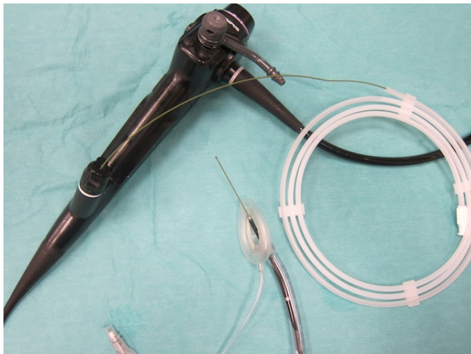
Figure 1: Use of LMA for difficult intubation. The guide wire is passed through the suction port of the fiberoptic bronchoscope.

Alternatively, intubation using an LMA and exchange catheter may be performed. The LMA provides a patent airway, a conduit for the bronchoscope and a means to control ventilation at the same time. The greatest challenge encountered when intubating through an LMA is its removal without dislodging the endotracheal tube, since the length of the endotracheal tube and LMA are similar. The proximal end of the tube tends to disappear into the LMA once the tube has passed through the vocal cords. A technique of LMA guided fiberoptic intubation with the use of a guide wire has been described (9). In this technique the fiberoptic scope is inserted through the LMA and the guide wire passed through the suction port of the scope (see fig 1). Once the guide wire is advanced into the trachea both the LMA and fiberoptic scope are removed, holding the guide wire in place. The endotracheal tube is then advanced over the wire and the guide wire is removed.