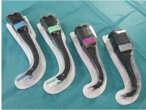
Figure 4. AirTraq may be used to guide placement of a bougie over which the tracheal tube is passed